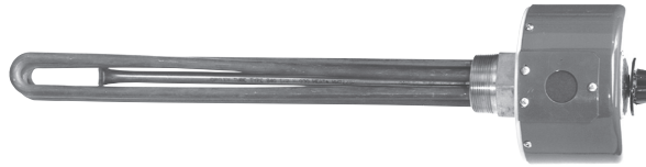
E1 — Dimensions (Inches)